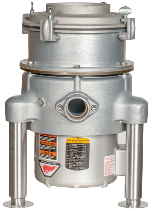
"B" Series Regular Design 7" Throat Size (Shown) Also available with: Offset Design with 7" Throat