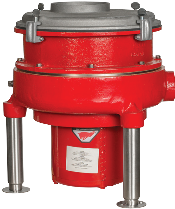
"C" Series Regular Design 7" Throat Size (Shown) Also available with: Offset Design with 7" Throat or High Drum