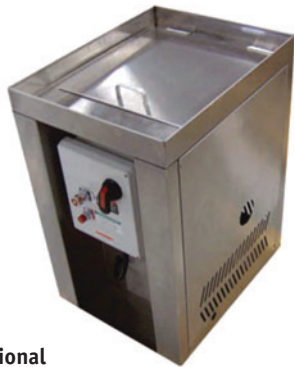
Shown with optional full enclosure stainless panels